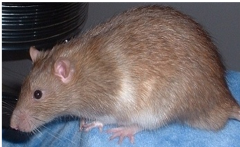
Cocount rat/House rat, Rattus rattus