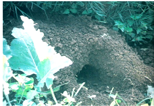
B. Indica burrow- open and large