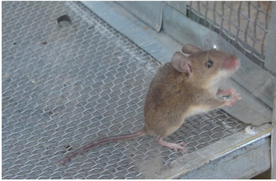
India Field mouse ( Mus booduga )