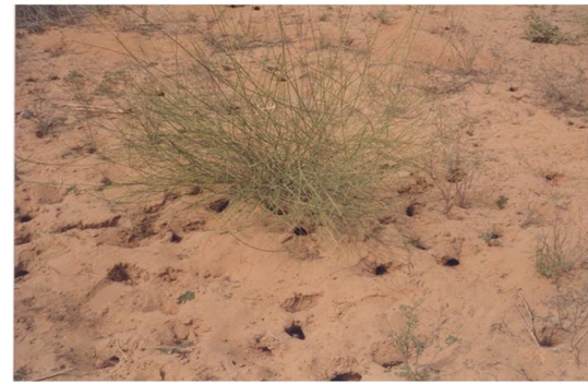
M. hurrianae - burrows in sand dunes