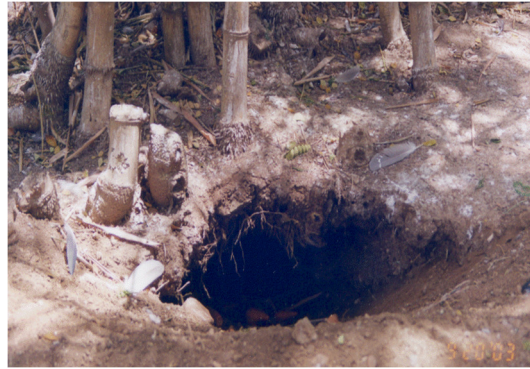
H. indica habitat-crevices and tunnels