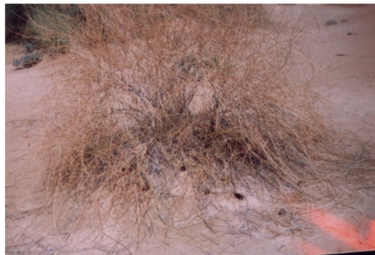
T. indica burrow complexes