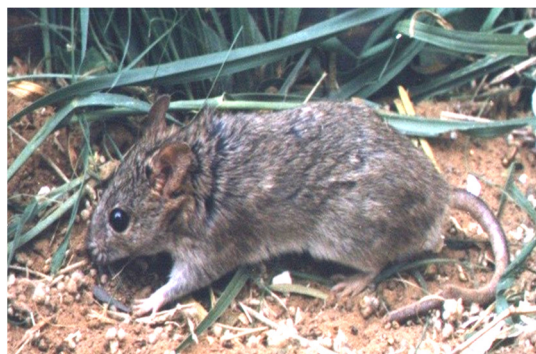
Soft furred field rat ( Millardia meltada )