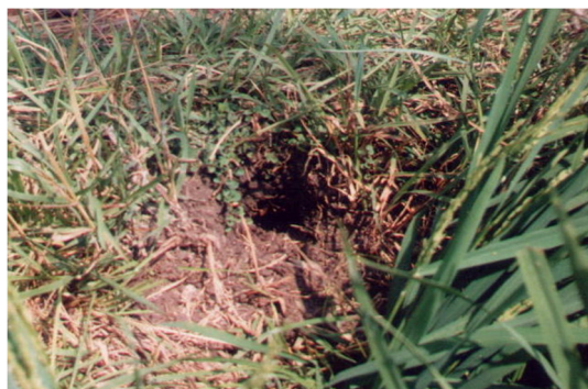
M. meltada Vertical burrow - without scoop