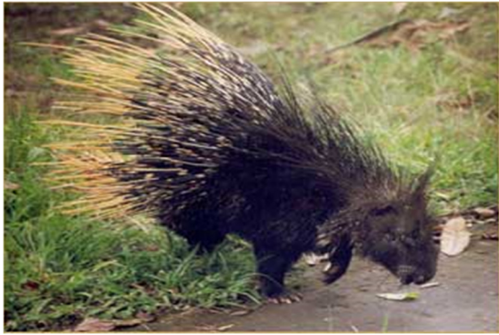
Indian porcupine, Hystrix indica