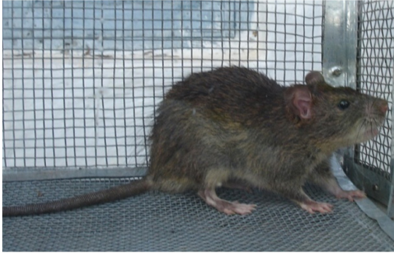
Lesser bandicoot ( Bandicota bengalensis )