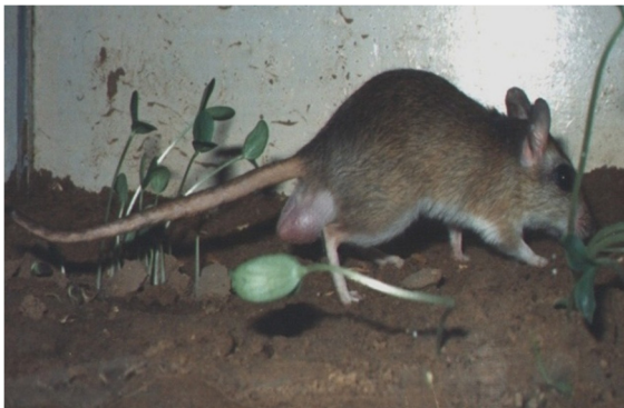
Common Indian Gerbil, Tatera Indica