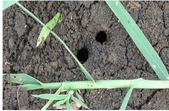
M.booduga round circular burrows