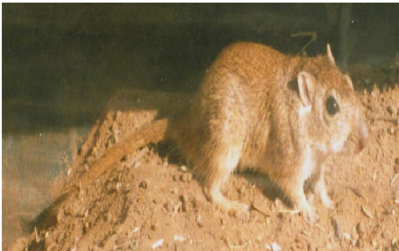
Desert Gerbil, Meriones hurrianae