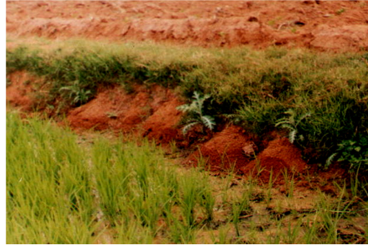
B. bengalensis burrows with scooped soil