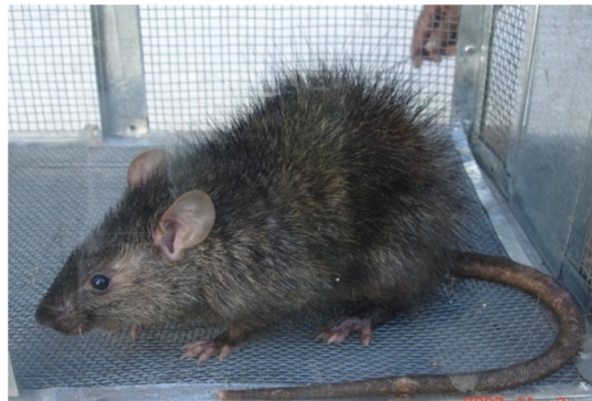
Larger bandicoot ( Bandicota indica )